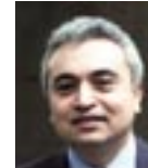
Keynote Speaker: Fatih Birol Chief Economist, International Energy Agency