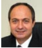
Mehmet Aktaş CEO, Yaşar Holding

One of the most sensitive dynamics of a sustainable economy, especially in light of changing conditions induced by the effects of global warming is agriculture and food sector. This session is intended to discuss predictions and needs in terms of foreign investments into agriculture and food sector.