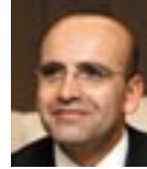
Keynote Speaker: Mehmet Şimşek Minister of State