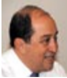
Nuri Çolakoğlu President of the Executive Board Istanbul 2010 ECOC

16.10 - 16.30 Istanbul 2010 ECOC Project