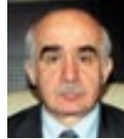
Nazım Ekren Minister of State and Deputy Prime Minister