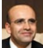
Mehmet Şimşek Minister of State