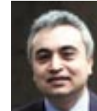
Keynote Speaker: Fatih Birol Chief Economist, International Energy Agency