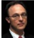
Keynote Speaker: Ulrich Zachau Turkey Representative, World Bank

Triggered by the sub-prime mortgage meltdown, this recent economic crisis spurs structural reforms in the economic and financial systems across the globe. This session is intended to discuss those risks and opportunities unfolding before the international direct investments that are shaped by this new setting in a changing world order.