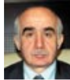
Nazım Ekren Minister of State and Deputy Prime Minister