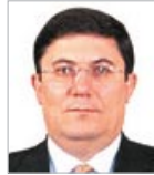
İbrahim Çanakcı Undersecretary of Treasury