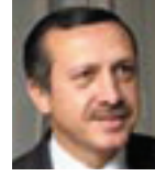
Guest of Honor: Recep Tayyip Erdoğan* Prime Minister of Republic of Turkey