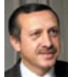
Recep Tayyip Erdoğan* Prime Minister of Republic of Turkey